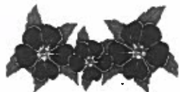
Village Flower "Chichirika"