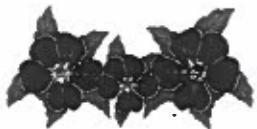
Village Flower "Chichirika"

Government of Guam • P.O. Box 786, Hagåtña, Guam 96932 Tel: (671) 472-8302 / 477-1333 • Fax: (671) 477-7131